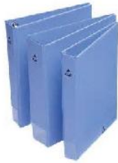
ESD Homogenous Vinyl Ring File Binder