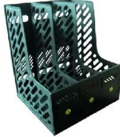
ESD Files Holder