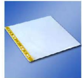
ESD A4 Hard Document Holder