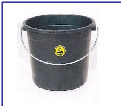
MEGA ESD WATER BUCKET