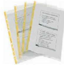
ESD A4 Soft Document Holder