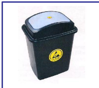
MEGA ESD DUSTBIN