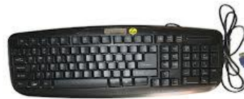
ESD Computer Keyboard