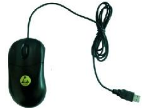
ESD Computer Mouse