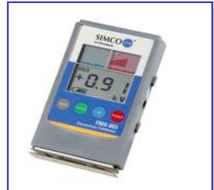
Mega SFM Static Field Meter