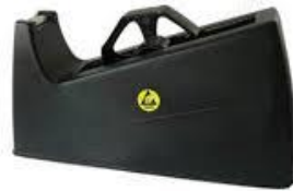
ESD Tapes Dispenser