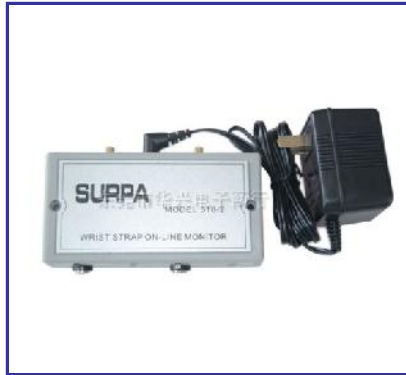
Twin Wrist Strap On-Line Monitor