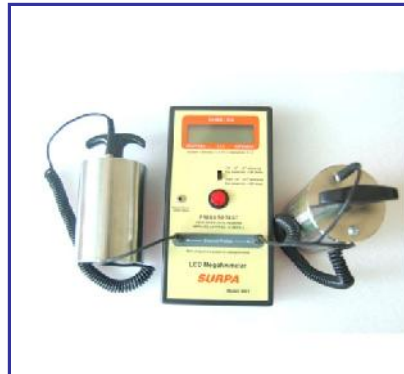
Mega Ohm Meter (Surface Resistance Meter)