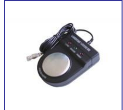
Wrist Strap Tester