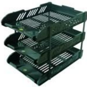
ESD Document Rack