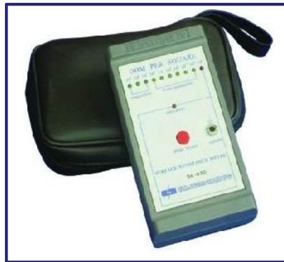
Mega SRM Surface Resistivity Meter