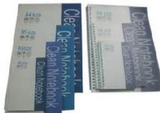
Clean Room Lint Free Notes Book