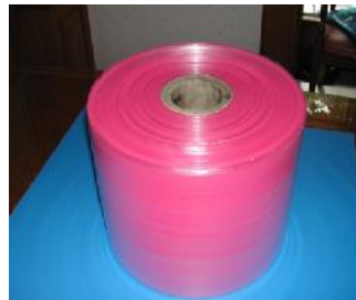
Antistatic Air Bubblepak