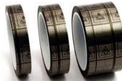
Conductive Grid Tape