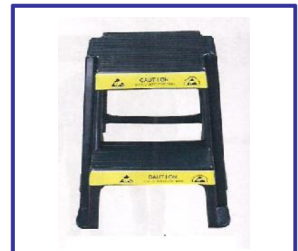
MEGA ESD 2 LAYERS LADDER