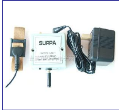
Single Wrist Strap On-Line Monitor