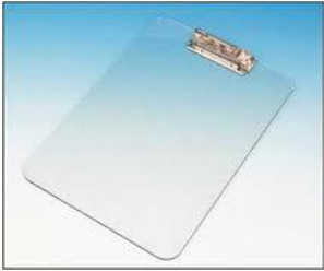
ESD Homogenous Vinyl Clip Board