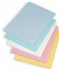
Clean Room Lint Free Paper