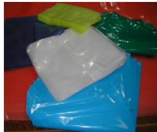
LDPE & HDPE Bags