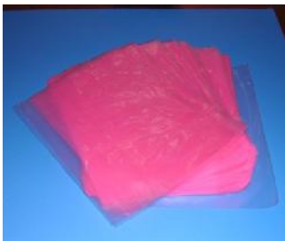
Antistatic PE Bags

Overall Size : 48mm x 96 Yards (80 Meters) Thickness : 45 Micron Color : Clear Transparent