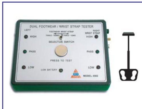
Mega Combo Tester Dual Footwear & Wrist Strap Tester